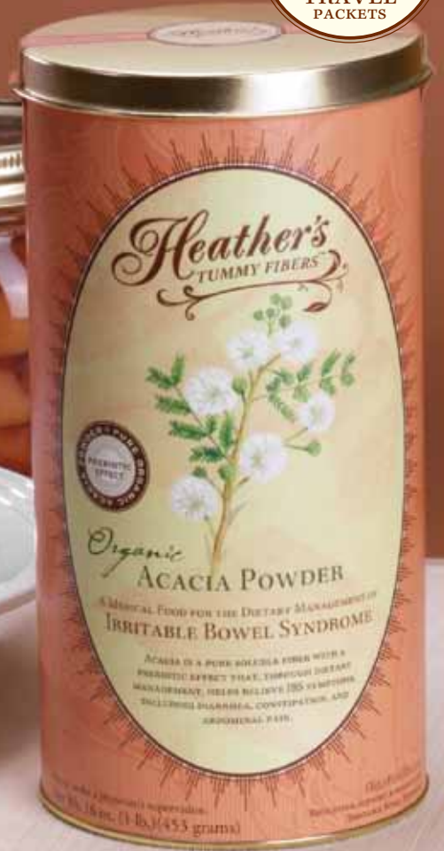
Pure acacia senegal, never low grade seyal